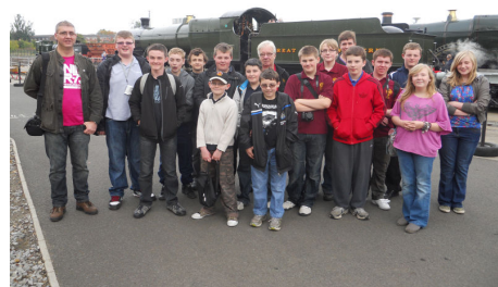
Visit to Shildon Locomotion Museum