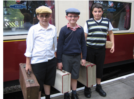
War on the Line evacuees