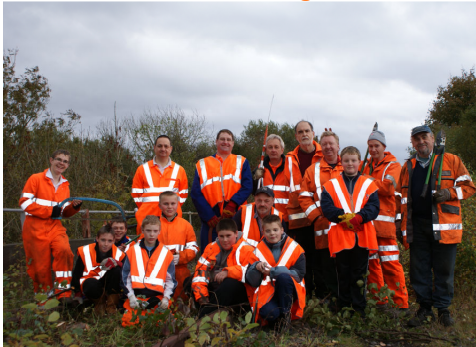
Clearing the line to Bishop Auckland